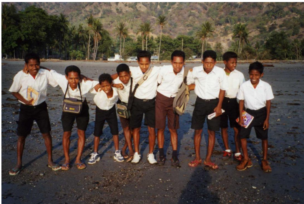
Junior secondary school students on their way to school in Vila

We are also seeking donation of two laptops computers for the visiting teachers to take home to East Timor to improve local IT skills.