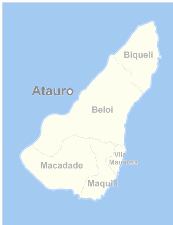
Atauro Island showing Sucos

A number of small hamlets are grouped into 5 districts (Suco): Bikeli and Beloi in the north, Makadade in the southwest, and Maquili and Vila in the southeast. The administrative village is Vila, and a bitumen road on the East coast connects Vila with the village of Pala in Bikeli Suco, and inland to Anartuto in the mountains in Makadade Suco. Other villages around the island are accessed by foot or by boat. The island can be reached from Dili by weekly ferry, or by smaller fisherman's boats. The island is ringed by a coral reef and provides excellent snorkelling and diving.