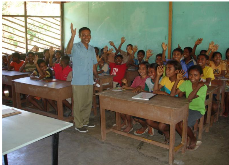
Primary School at Berau Village, Atauro

People on Atauro Island are multilingual. There are three local dialects spoken on the island. The National Language is Tetum, a language based around dialects from the East Timorese mainland with many words from Portuguese. The official language of East Timor is the language of the first Colonial authority – Portugal. Government policy is for Portuguese to be taught in schools and universities, though most of the population speaks limited Portuguese. The language of the more recent colonial authority, Indonesian, is more widely spoken. Increasingly, English is being recognised in East Timor as the common language for many NGO operations, for international trade, and particularly relevant to Atauro Island, for tourism. Teachers of English on Atauro have limited knowledge of the language, and little idea of its ‘sound’, thus restricting the opportunities for local students to learn English properly. English speaking visitors provide an important opportunity for locals to listen to the language and to learn it beyond what local teachers can teach.