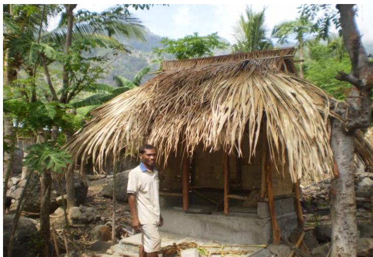
Composting toilet in Maquili funded by Indigo

The project is currently being managed through local NGO Roman Luan and project organisers in the two villages involved in the pilot process.