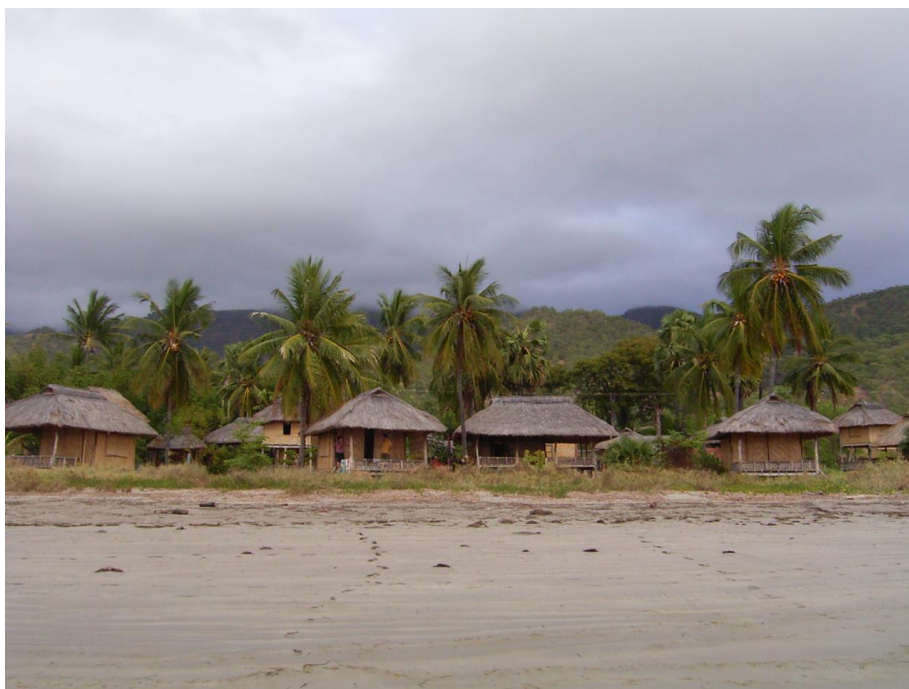
Tua Koin Eco village